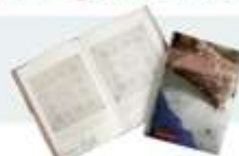
Exquisite and unique quilt designs