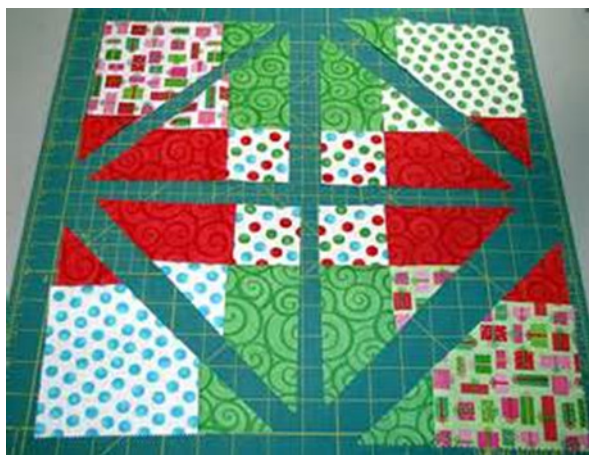
Disappearing 9 patch cuts