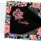
Creative sewing and embroidery projects

Monday and Tuesday October 16th & 17th 8:00 am to 5:00 pm both days