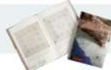
Exquisite and unique quilt designs